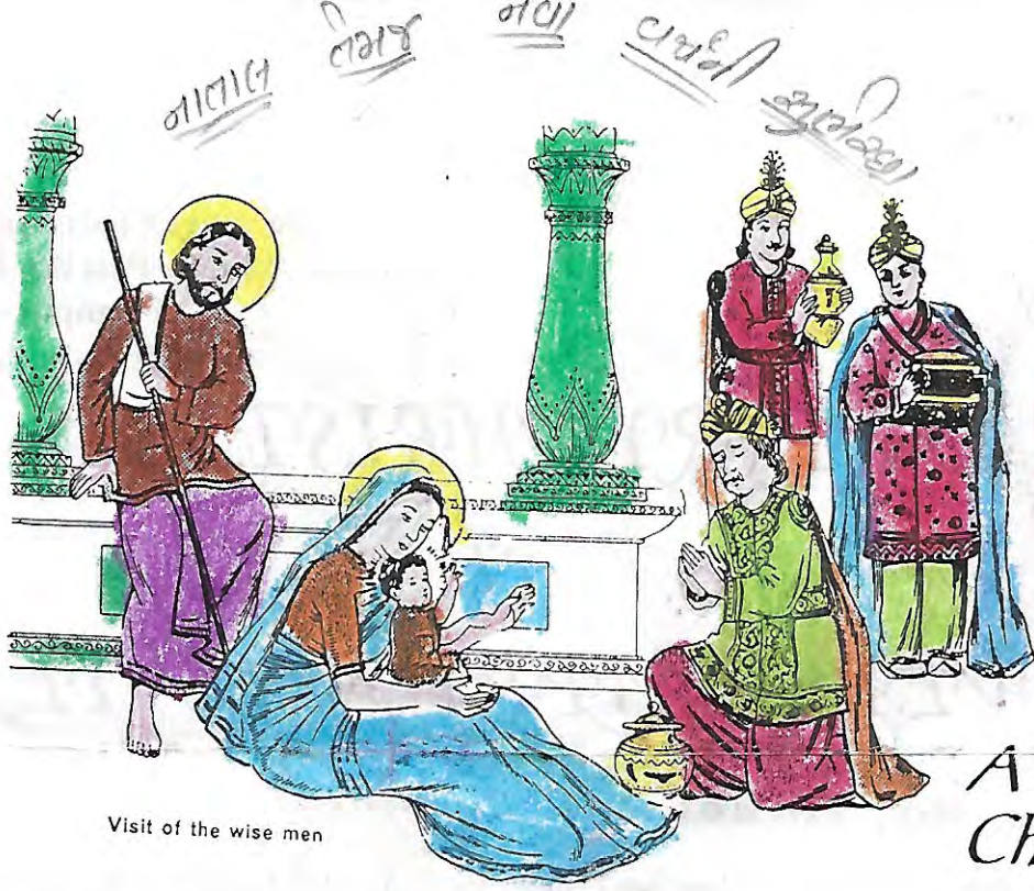
Visit of the wise men