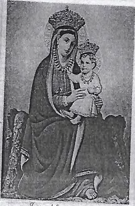
I prayed for you in a very special way at the Shrine of Our Lady of Groves at Fardluna, India

Convent of Jesus and Mary, Catholic Ashram, Post Box No : 31 Palanpur 385 001 Gujarat, INDIA